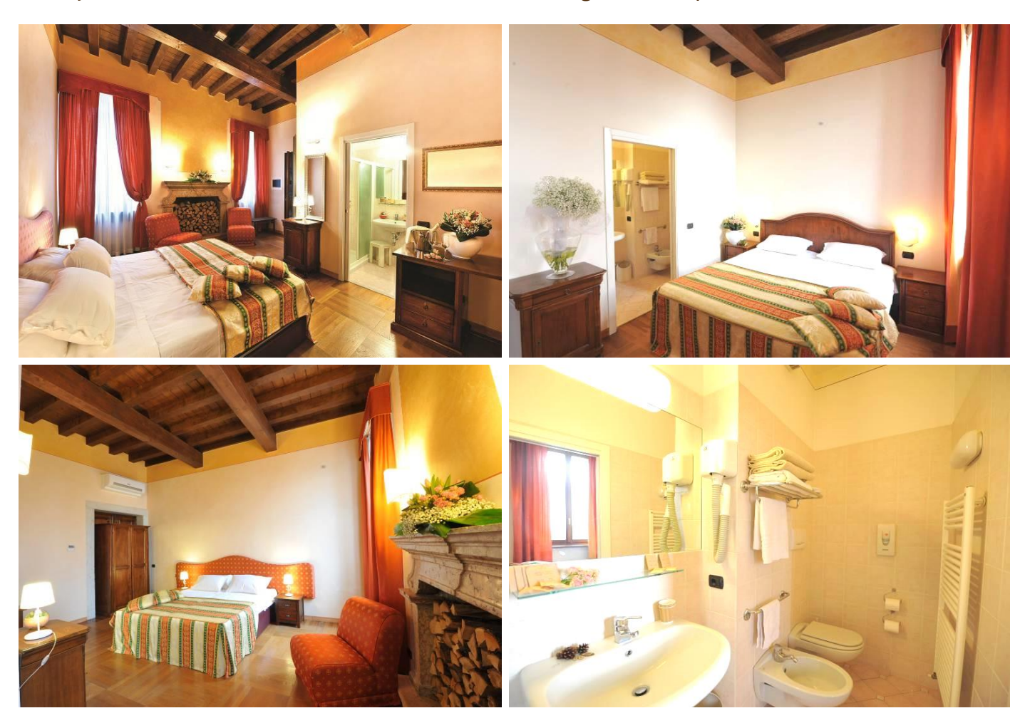
Our staff will welcome you in a cosy and sophisticated atmosphere that will make you feel "like home".

All guestrooms retain the glamorous spirit of a Venetian historical Villa but have been sympathetically adapted to accommodate the requirements of the contemporary traveller. All of our Standard , Superior and Junior Suites feature free wifi internet access, private bathroom, hairdryer, international satellite channels, air conditioning, safe, telephone and minibar.